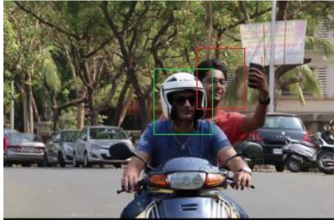
Fig.4 Bike rider wearing Helmet and pillion rider not wearing Helmet