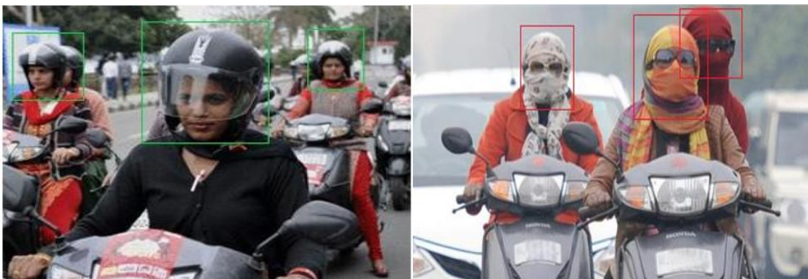
Fig.3 Motor cycle riders wearing Helmet Fig.4 Motor cycle riders not wearing Helmet